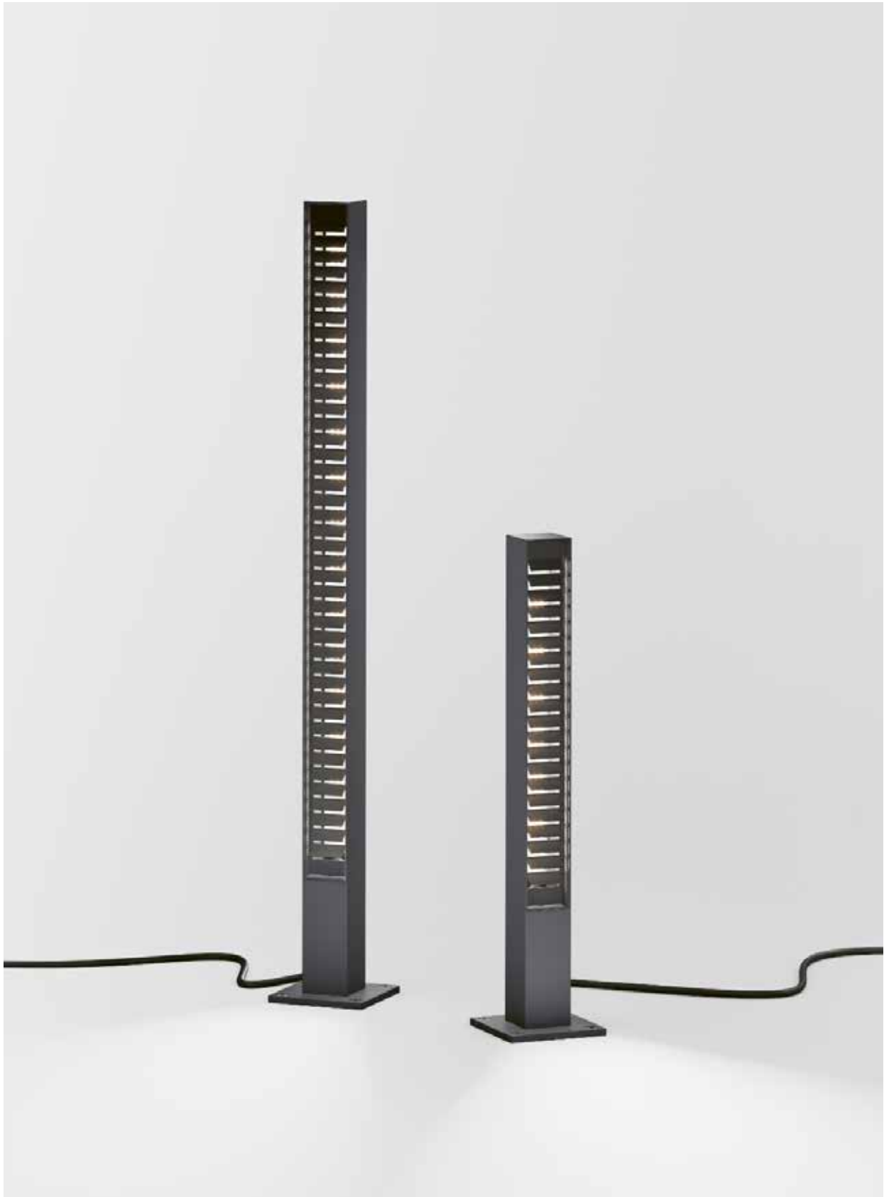
lin base Design: IP44.DE