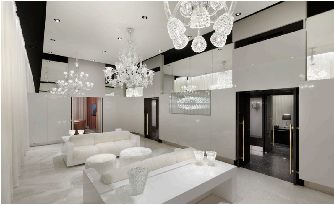
↗ Saratoga customisation for white room, Palazzo Barovier e Toso, Venice. 2019