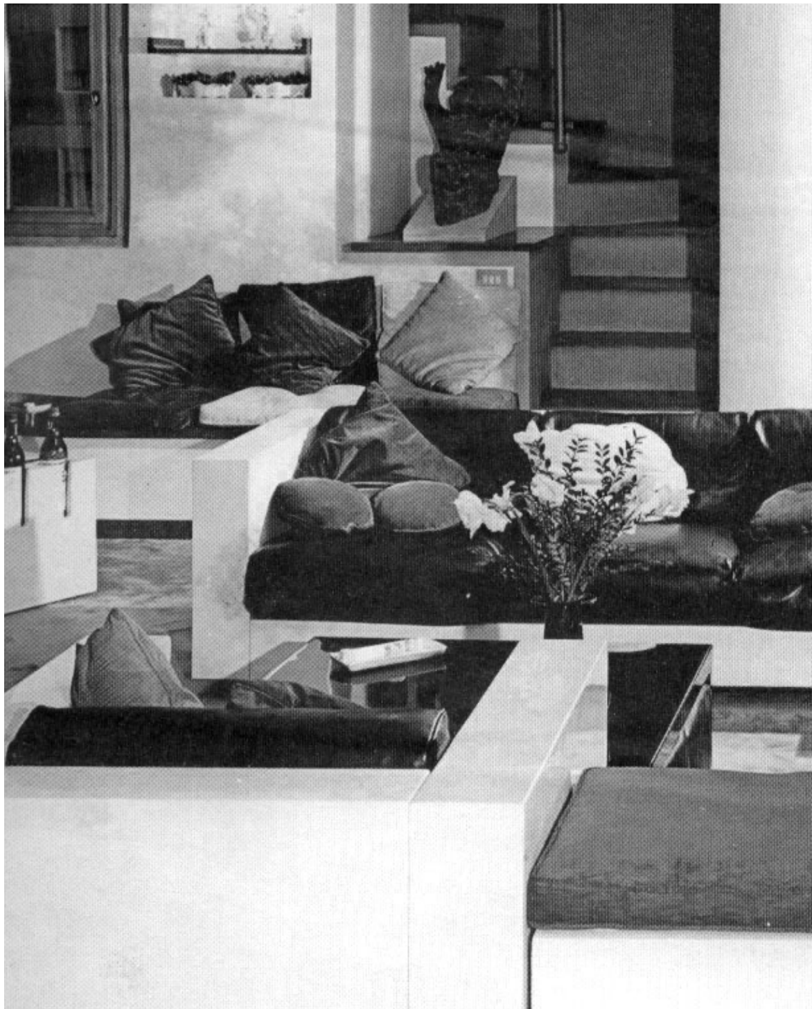
↗ Old negative from Poltronova archive.