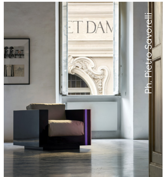
↖ Contemporary Cluster, Rome. 2020