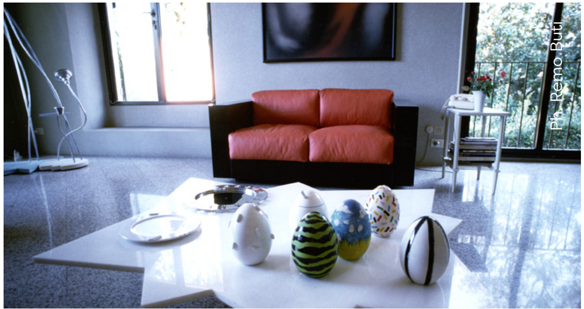
↖ Remo Buti's house.