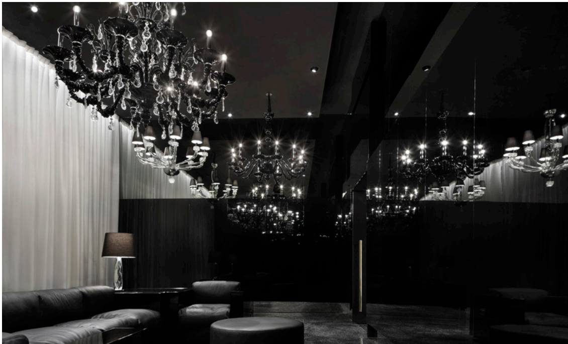
↘ Saratoga customisation for black room, Palazzo Barovier e Toso, Venice. 2019