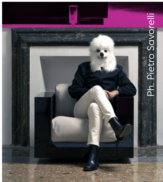
↖ Contemporary Cluster, Rome. 2020