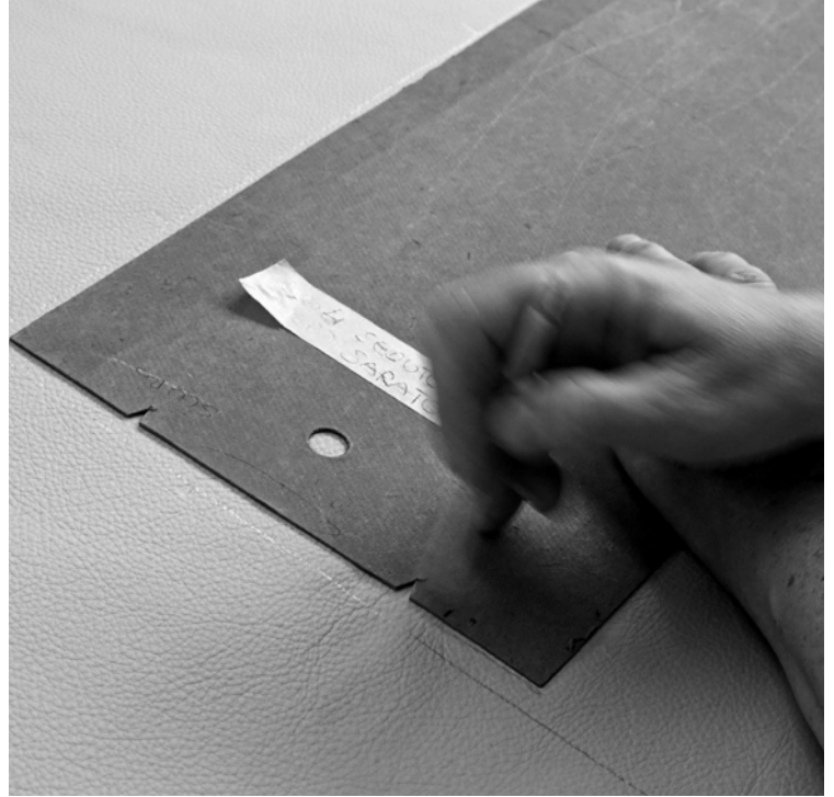
Poltronova factory, Agliaia. 1964—2020