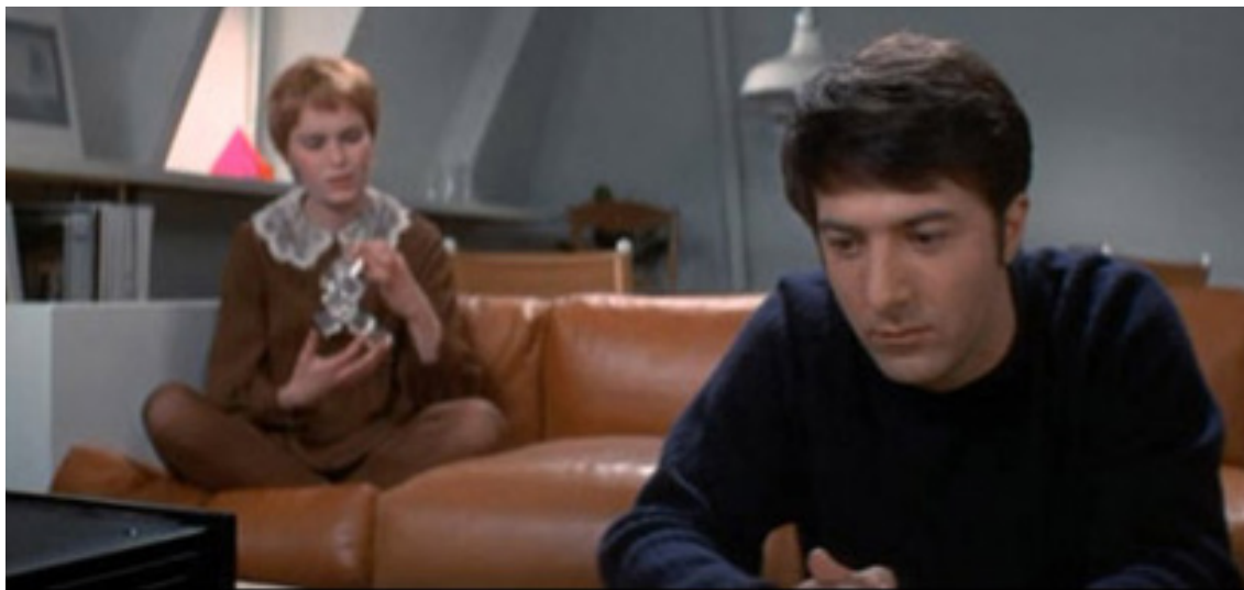
↯ A frame from "John and Mary" by Peter Yates / Mia Farrow movie, on the Saratoga sofa (version with white structure and cushions covered in leather), and Dustin Hoffman, in the foreground. 1969